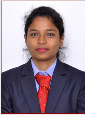
Class Representative- I MBA