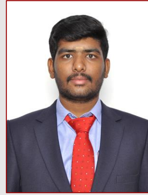
Class Representative- I MBA