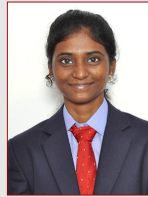
Class Representative- I MBA