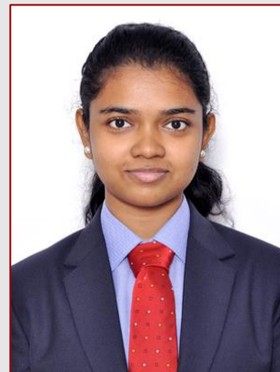
Co-curricular L JUDSY