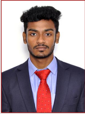
Class Representative- I MBA